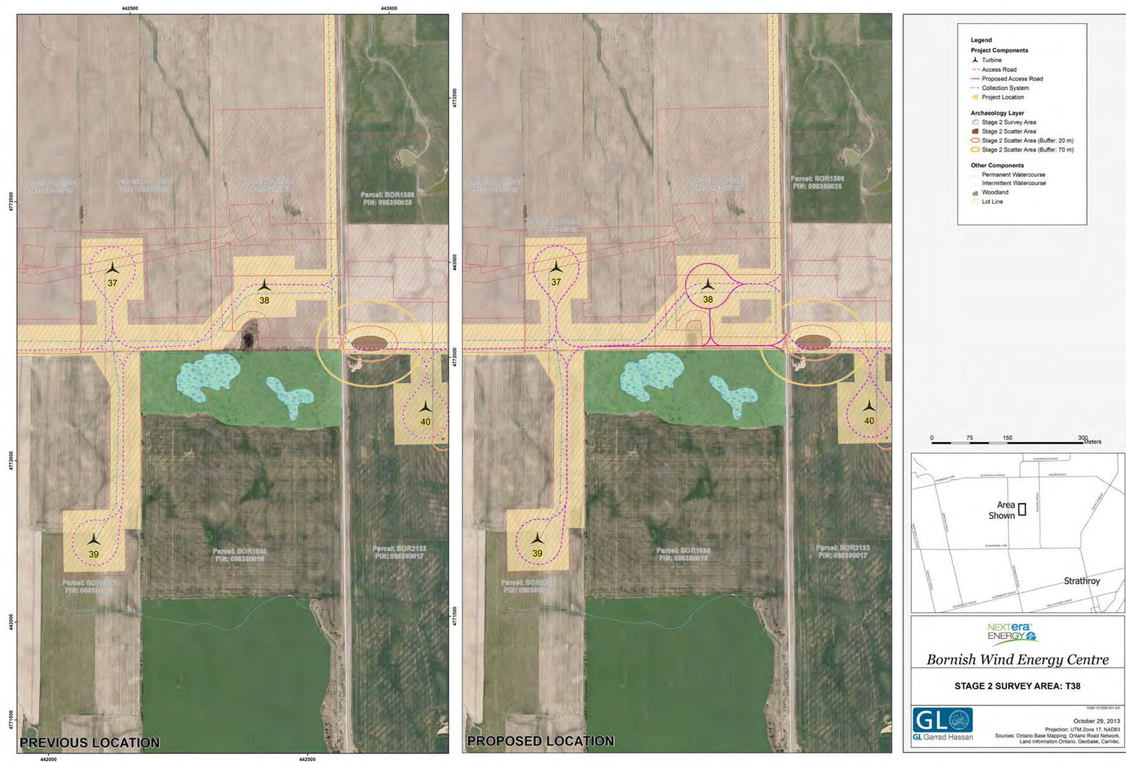
Figure 2-1: Proposed Layout Modification